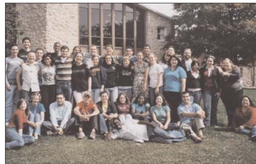
Members of the Westchester County Senior Youth Council

The Westchester County Youth Council, a program of Family Services of Westchester, hosted the Youth Action Convention on March 22 at Pace University in Pleasantville.