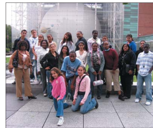
The Westchester Scholars at the Haden Planetarium

Westchester is gearing up for a spectacular event right in our own backyard. For the first time ever, the prestigious Empire State Games, the largest amateur sports competition second only to the Olympics, is coming from Wednesday, July 25 through Sunday, July 29. Now in its 30th year, the Empire State Games is a program of the New York State Office of Parks, Recreation and Historic Preservation and is run in conjunction with the local community in which they are held. (Continued on page six)