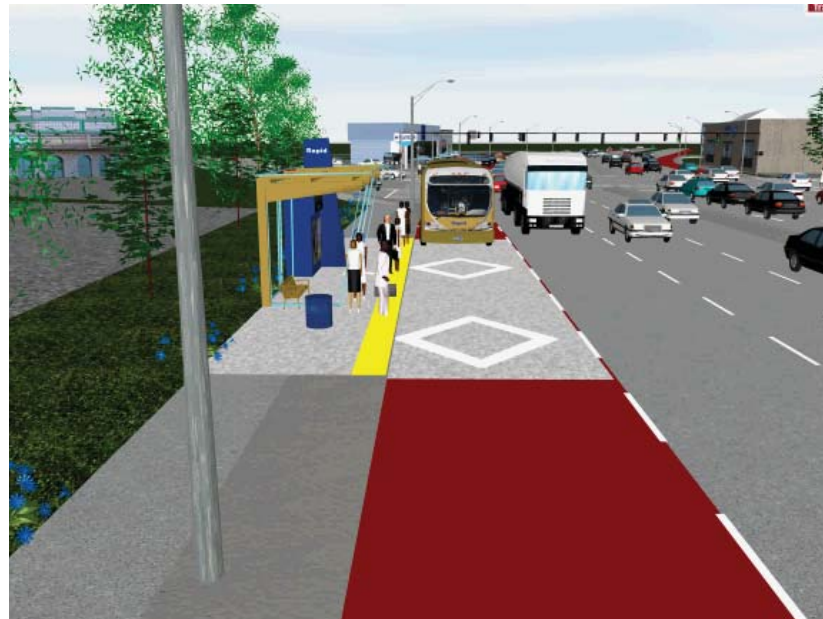
Exclusive lanes for BRT and other Bee-Line buses on Central Park Avenue.

New BRT stations could feature station identity signs, stylish shelters, seating and ticket vending machines. Level boarding platforms could match the low-floor vehicles permitting step-less entry. Route maps, schedule boards, and electronic bus arrival/countdown signs would keep customers informed. Convenient park-and-ride lots and bicycle racks provide parking for customers. Station artwork can enhance the travel experience.