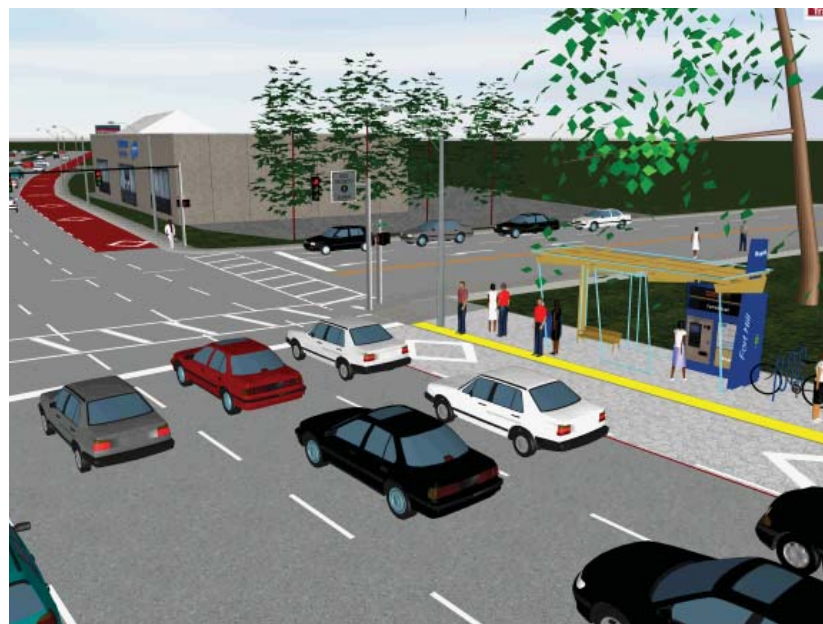
Concept rendering of the proposed BRT station at Fort Hill Road.