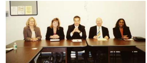
Local business professionals participate in a mock interview/ coaching session for Project Transition students

Information technology * Media Communications * Higher Education * Health Care * Also, several prominent law firms, medical practices, retail establishments...and more!