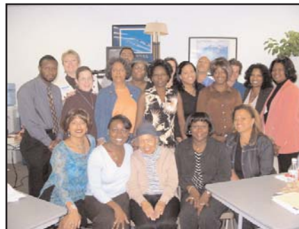
The Mount Vernon coalition

The CTC process provides a "blueprint" for how to initiate, develop and sustain a community coalition. By involving stakeholders, which includes parents, elected officials, community leaders, merchants, youth, faith-based leaders, etc, communities have been able to develop a community